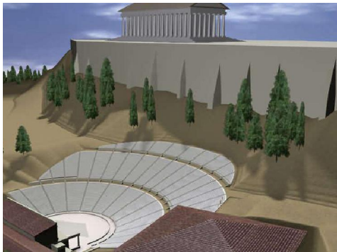
Figure 1: Theatre of Dionysos at Athens

The Theatre of Dionysos at Athens was first dug out of the slope beneath the south side of the acropolis built in 342-326 B.C. for archon Lycurgus at the site where various theatre buildings had been erected since the early 6th century B.C. ( Fig 1 ). Alterations in the 3rd and 2nd century B.C., and then again ca. 61 A.D. under Roman emperor Nero (raised stage, stone proscenium, 2nd skene storey). Marble barrier between skene and audience added in the 1st century A.D. The Theater like many of its descendants was built in the open air of an acropolis. A lot of important and revealing information about the theater of the fifth century B.C. has been lost forever due to changes made by the Romans. This leaves scholars of today with scant evidence of ancient Greek Theater architecture. The skene of the Fifth Century Theater is believed to have been a temporary structure, erected and taken down for each festival. It was constructed using light and perishable materials until later, when theaters were built in stone. At that point, a permanent stone skene was built 11 . More became known about the skene after it changed to a permanent, stone fixture in the theater of the fourth century B.C.