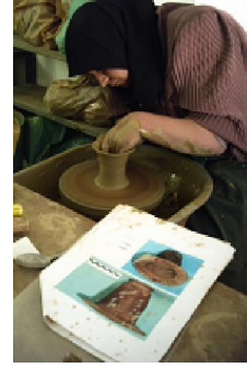
Figure (23): Modeling on the wheel.