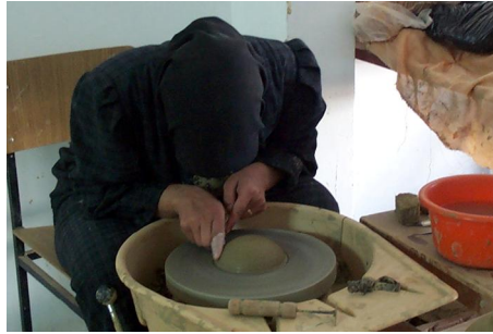
Figure (27): Smoothing Stage.