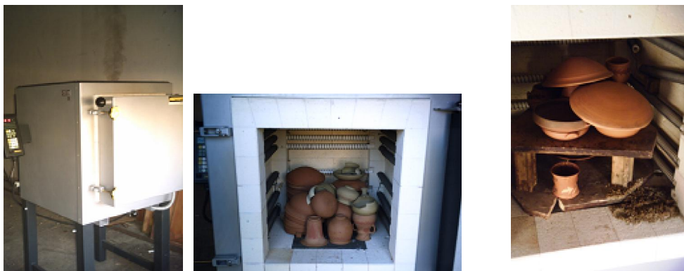
Figure (30): Firing Process and Controlled Firing Programs.