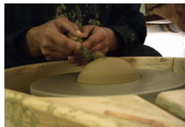
Figure (25): Turning and Trimming on the wheel.