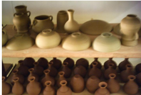
Figure (28): Another Slow Drying Stage.