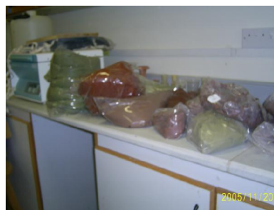
Figure (22): Slurry Partial Drying, Wedging and Kneading.