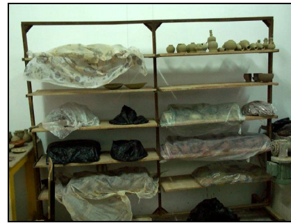
Figure (24): Slow drying after modeling on the wheel.