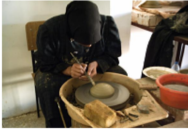
Figure (26): Slipping Stage (if needed).