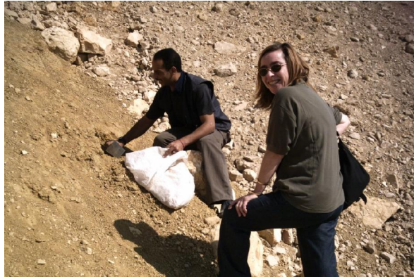
Figure (20): Clay Collection from Ayn at-Tinnah site near Petra.