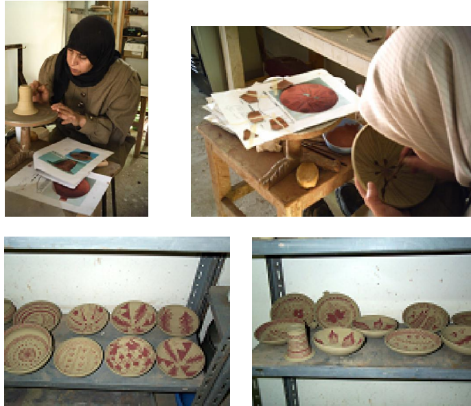
Figure (29): Painting and Decoration.