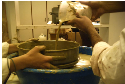
Figure (21): Clay Cleaning and Levigation.